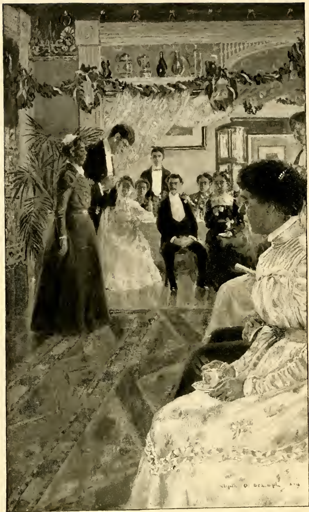
"THIS IS THE WOMAN, AND I AM THE MAN" (page 24)